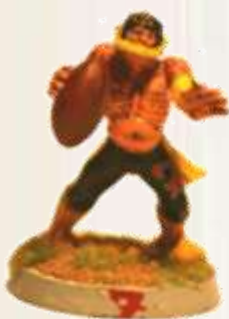
Ike Lonesome Thrall Lineman , BATting Cobras