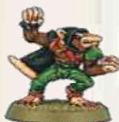
Willy Vånd Gutter Runner Ratten Kameraten