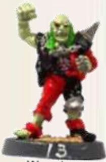
Weesler Zombie, Horrid SkinEaters