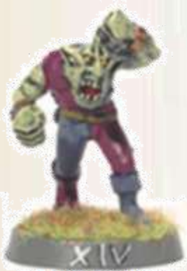
Cambyses II Hobgoblin Runner, Hooves of Hashut