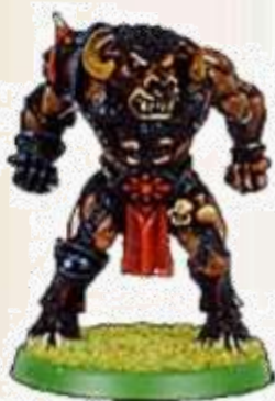
Kaacvooc Côte de Boeuf Minotaur, Motbydelig Horde 1994